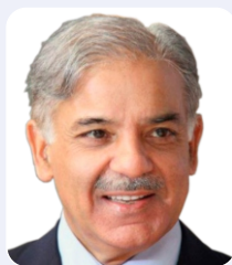
Mian Shahbaz Sharif CHIEF MINISTER