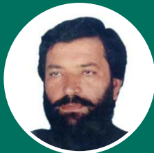
Leader of the Opposition