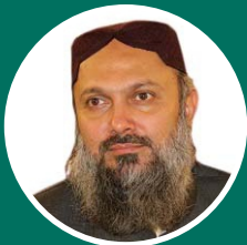
Leader of the House